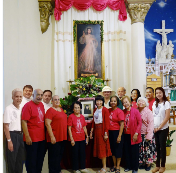
(Pictured: Legion of Mary and the Divine Mercy prayer group)