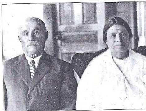
Example taken from the Portuguese Hawaiian Memories—1930.