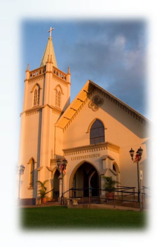
Religious Organizations & Movements

If you would like to join any Religious Organizations or Movements, please see the church website or bulletin for its current ministry coordinator.